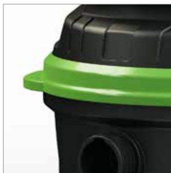
Side protection against doors and walls