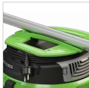
Ergonomic handle with integrated cable wrap