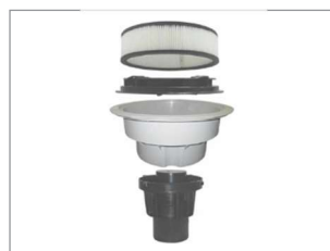
SYSTEM DFS FOR SIMULTANEOUS DRY AND WET PICK UP