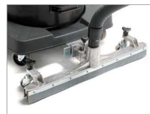
OPTIONAL FIXED ACCESSORY